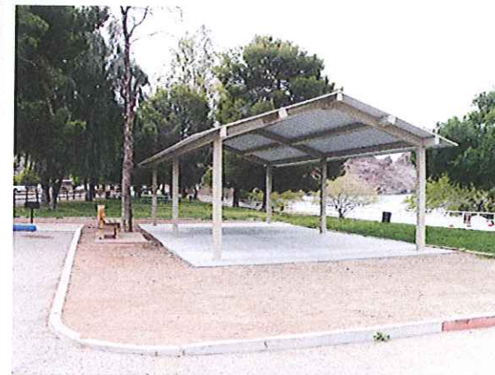
Alamo Lake State Park Group Ramada