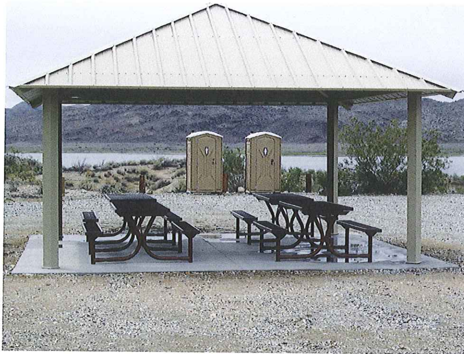
Patagonia Lake Group Ramada